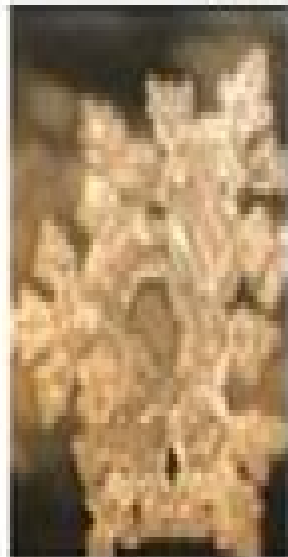
Air on a G string by Bach