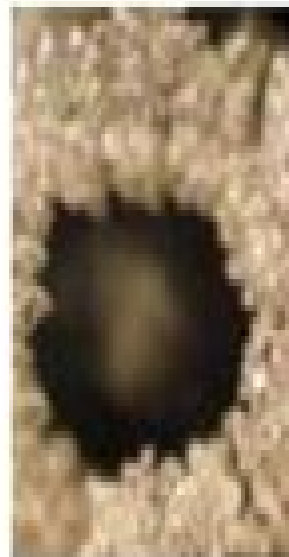
The word Spirit