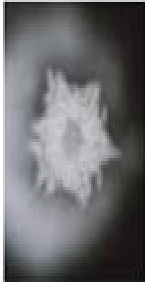
The word Peace